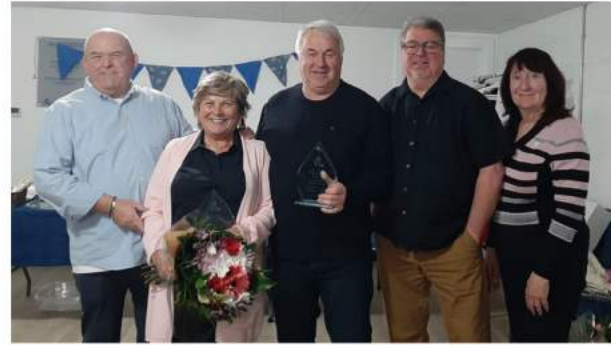
Volunteer of the Year Award

This year the Volunteer of the Year Award